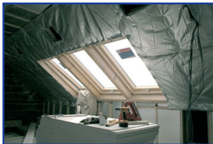
A secondary quilt of insulation is then fitted. Re-style work to the highest standards, and comply with all building regulations