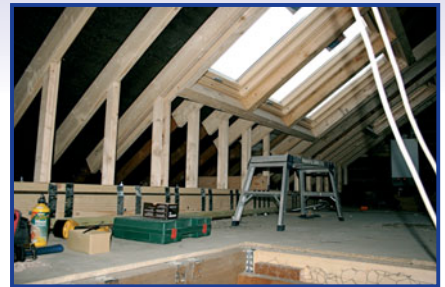
New support frame for the new room's roof and floor. Old roof supports were removed to take advantage of space in the eaves