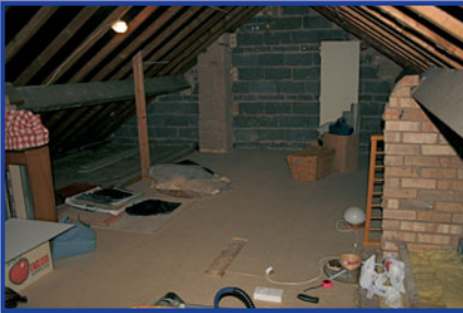
Margaret's dusty loft before work began. The area is used to store boxes