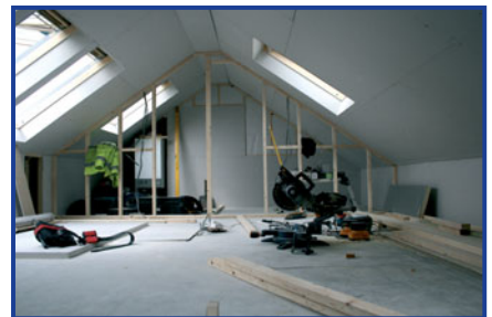
Plasterboard is fitted to walls and floor. Frame for the bathroom and walk-in wardrobe is erected