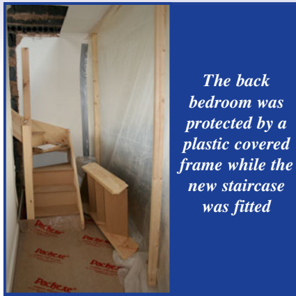
The back bedroom was protected by a plastic covered frame while the new staircase was fitted

Re-Style Loft Conversions will organise your project's planning permission. The company's qualified joiners, plasterers, electricians and plumbers ensure that every loft conversion is completed to the highest standard