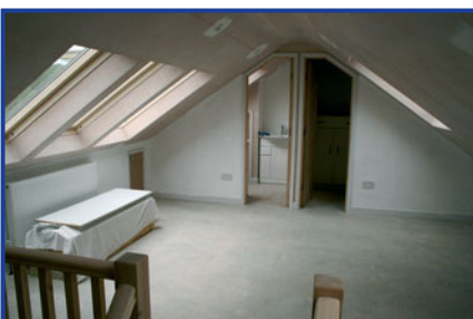
The staircase balustrades are completed and the room is plastered