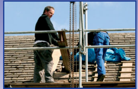
The girders are lowered into the loft via a small hole cut into its roof. Six Velux windows are fitted

Re-Style Loft Conversions will organise your project's planning permission. The company's qualified joiners, plasterers, electricians and plumbers ensure that every loft conversion is completed to the highest standard