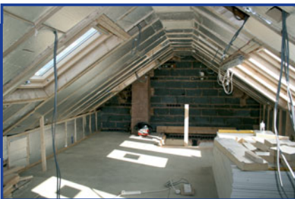
First layer of insulation is fitted. Electrical wiring is installed, as well as pipework for the sink and central heating