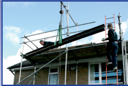
Four steel girders are hoisted into the loft by workmen. The girders formed the frame of the new room