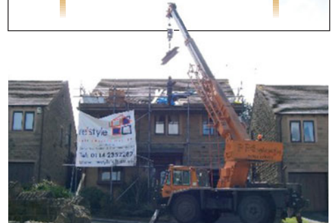
Structural steels being fitted

did all the plastering, electrical and plumbing work, which included fitting five new radiators. The project was completed on schedule in nine weeks.