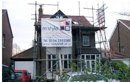
The job was completed in less than eight weeks