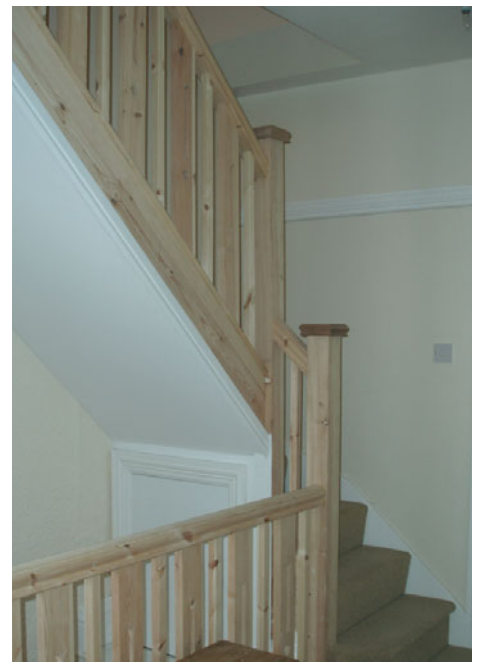
The new loft staircase is now ready for decorating

The loft conversion was finished on schedule - within budget - in under