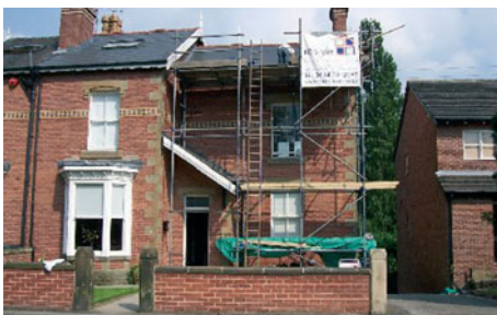
The project took three weeks to complete